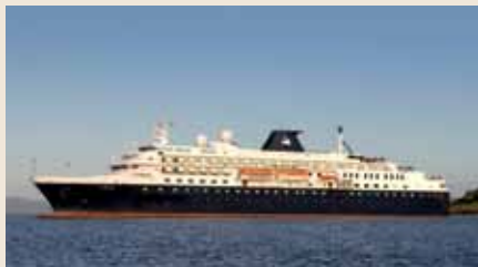
An artist's impression of the newly upgraded Minerva.