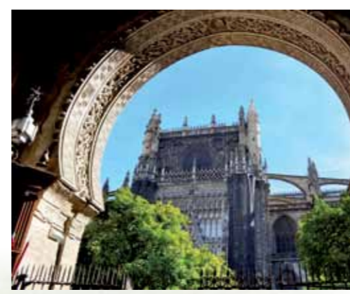
Seville Cathedral, Spain

Medina of Tetouan – From Tangier visit the Medina of Tetouan located on the steep steps of the Jebel Dersa, which from the 8th century onwards served as the main point of contact between Morocco and Al Andalus in Spain.