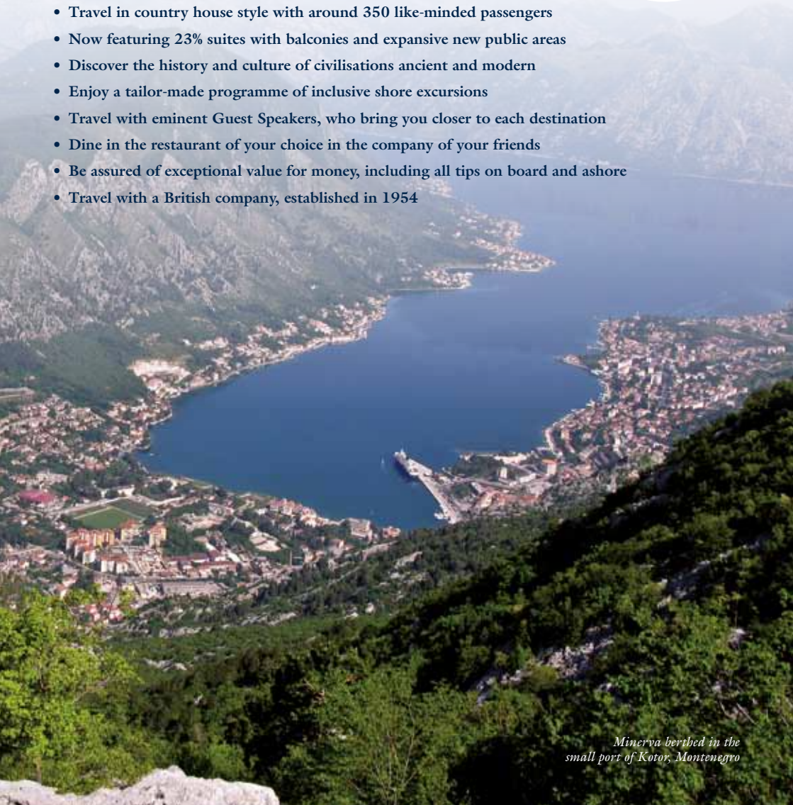
Minerva berthed in the small port of Kotor, Montenegro