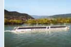
mv A-ROSA Riva, The Danube