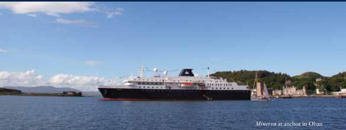
Minerva at anchor in Oban