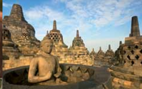
Borobudur Temple, Indonesia