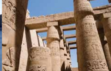
Temple of Karnak, Luxor