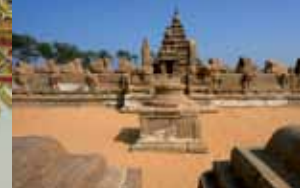
Shore Temple, Chennai