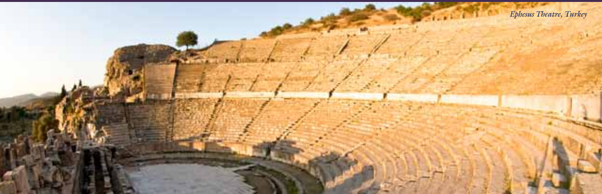
Ephesus Theatre, Turkey