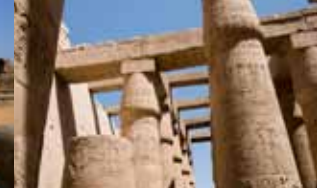
Temple of Karnak, Luxor