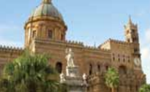
Palermo Cathedral, Sicily