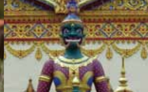
Wat Chaiya Mangkalam, Penang