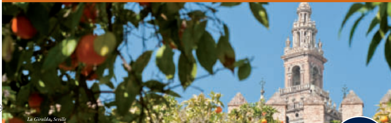
La Giralda, Seville