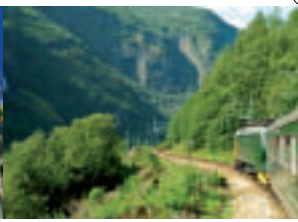
Flam Railway, Norway