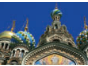
St Petersburg, Russia