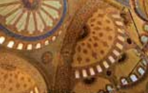
Blue Mosque, Istanbul