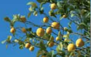
Lemon Trees, Italy