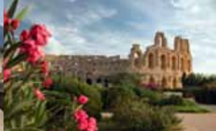
El Djem, Tunisia