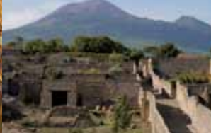
Pompeii with Mt Vesuvius, Italy