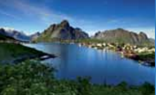
Lofoten Islands, Norway