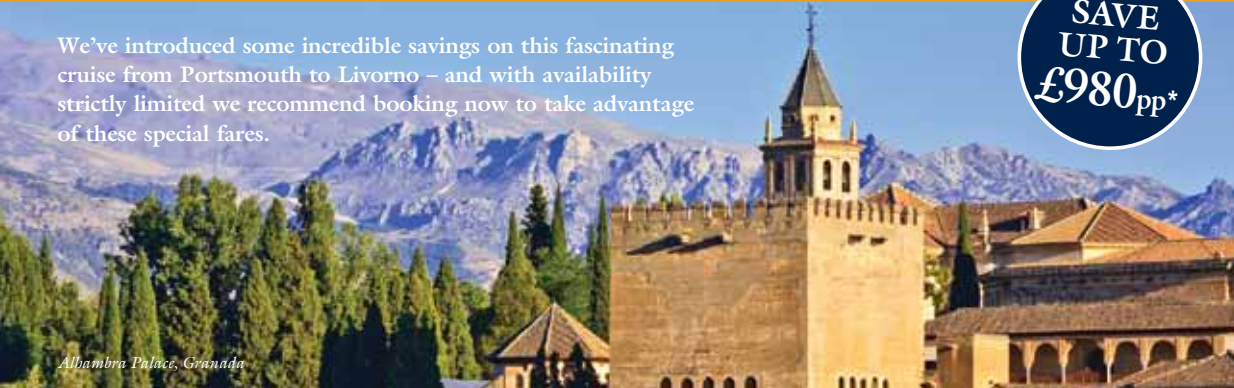
Alhambra Palace, Granada